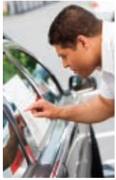
The Initial Vehicle Registration Fee will raise approximately $64.6 million annually for transportation improvements in Northern Virginia.

On July 12, 2007 the Northern Virginia Transportation Authority (NVRTA) approved the implementation of seven taxes and fees, as authorized by the General Assembly in the Transportation Finance and Reform Act of 2007 (HB3202), which will generate approximately $300 million annually in new transportation funding for Northern Virginia. The monies collected through these taxes and fees in Northern Virginia, stay in Northern Virginia and will fund vital transportation projects which will improve traffic congestion throughout the region.