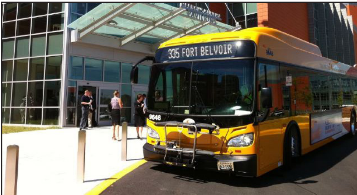
Fairfax County Connector Bus